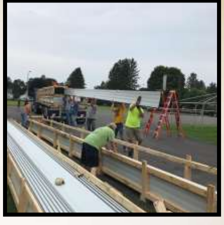
Gods Work Our Hands: Check out our awesome volunteers who have spent countless hours getting us to this point in our building project! We could not have done it without them!