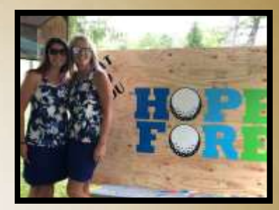
Our 4th Annual Hope FORE a Future Golf Tournament raised over $13,000 for the building. We hosted 20 teams and are forever grateful for the golfers, volunteers and sponsors!