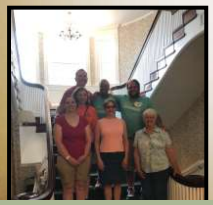
▲ Hope Volunteers made a meal for the famlies at Ronald McDonald House in July.