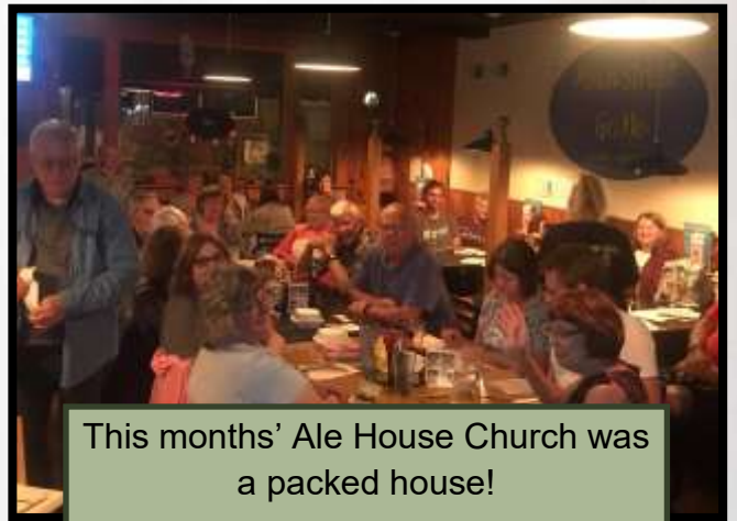
This months' Ale House Church was a packed house!