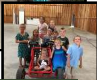
Sunday mornings are brightened by the younger youth that greet one another and play together !