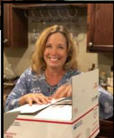
One of the Ladies Groups put together care packages for the College students!