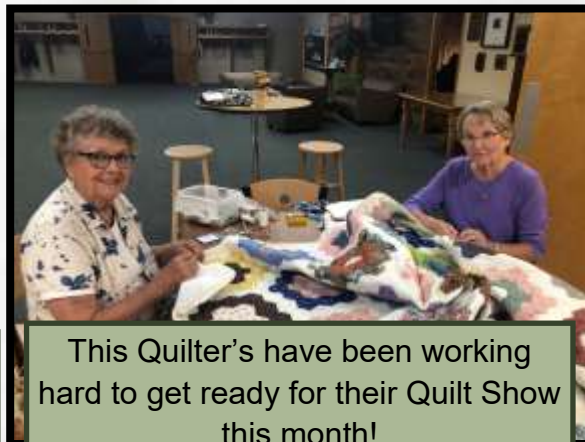
This Quilter's have been working hard to get ready for their Quilt Show this month!