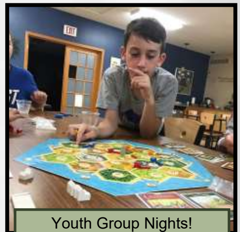
Youth Group Nights!