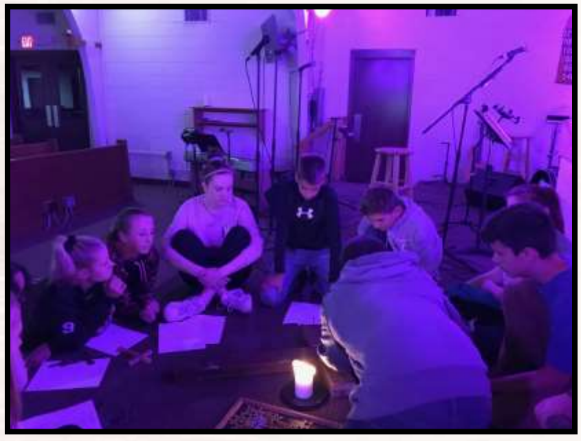
Confirmation classes have kicked off this school year on Sunday nights and they are a hit!