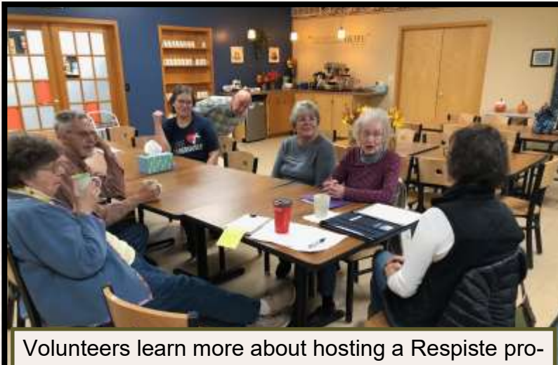
gram at Hope.