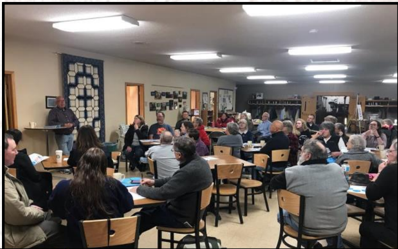
Hope is building! Recently a church wide meeting was held to update the congregation on our building plans. A few days later ground was broken and its all systems go for building Hope's Ministry & Community Center!