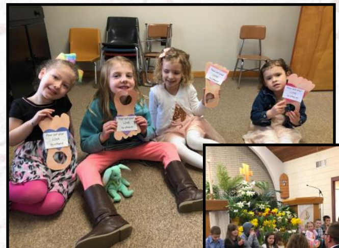
Lent & Easter brought much excitement and great lessons about Jesus for our little Hoppers.