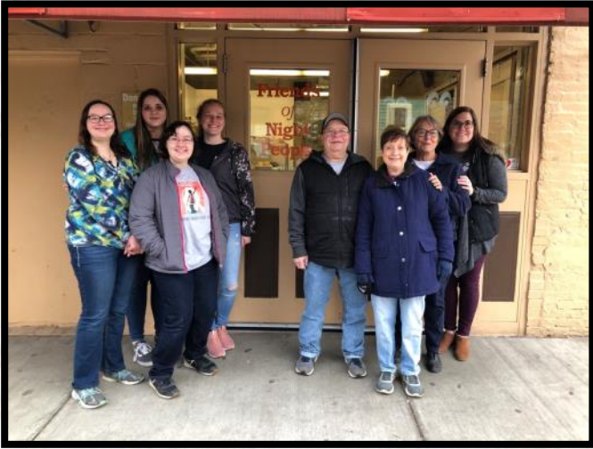
Members of Hope volunteered at Friends of Night people in early April.