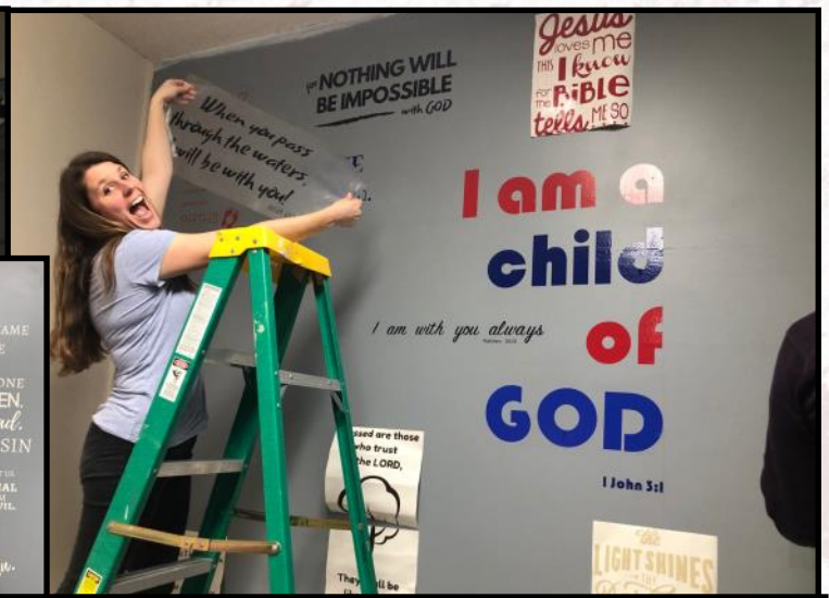
▲ The Sprouting Hope room got an inspirational face-lift with bible verses suggested by the youth and the Lord's Prayer. Special thanks to the many volunteers that made it happen!