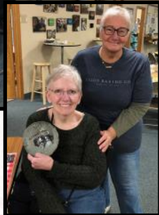
The 3rd Annual Empty Bowls Fundraiser raised over $4,800-- all of which supports ending hunger.