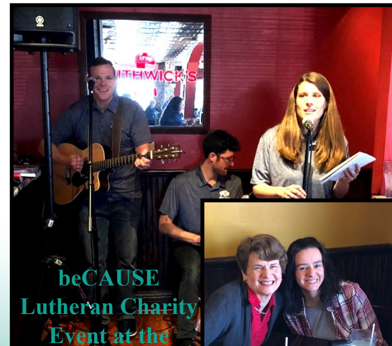
beCAUSE Lutheran Charity Event at the Buffalo Brew Pub