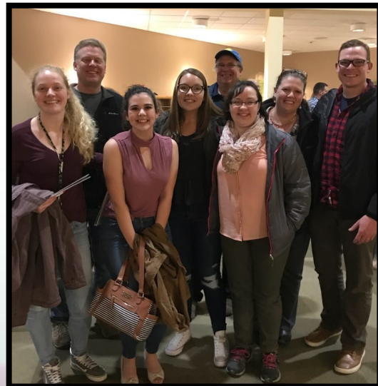
Above: Planning is underway for VBS : August 6-9