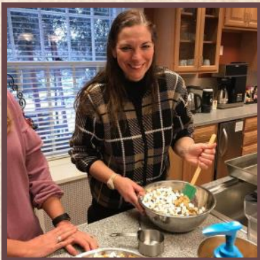
A tasty meal was prepared by our Ladies of Hope Book Club for the families at the Ronald McDonald House in February.