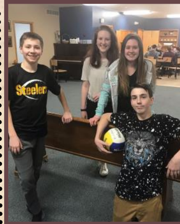
Youth Group Fun in February! .....