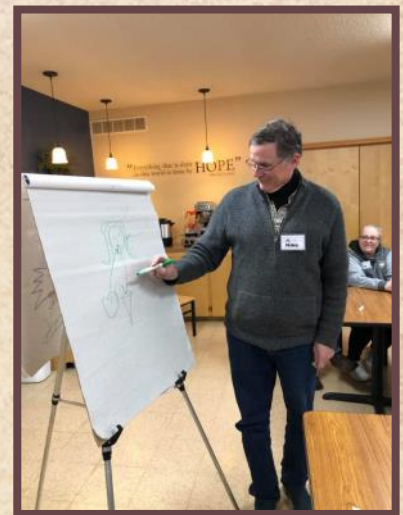
Valentine's Day Cards, Bingo and Pictionary were hits during this month's Respite Program. A special thank you for the many stuffed animal donations we received for Bingo prizes.