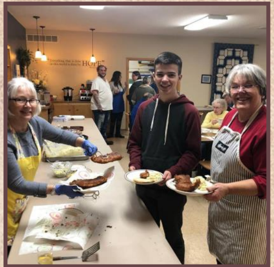
Hope's first Fish Fry of the year raised $1,450 to install high speed communications at Hope. Thank you to our volunteers and to those who made donations and came out to enjoy the fish fry! .....