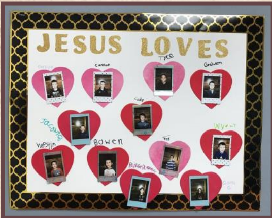
Our Sprouting Hope kids learned a lot about love this month during their time together during worship!