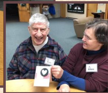
Also a special thank you to Arcade McDonalds for their donation of lunch for this month's program.