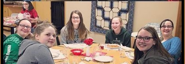
Our youth enjoyed a Valentine's Spaghetti Dinner served by Arcade Girl Scouts.