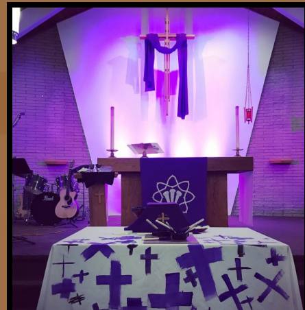
A beautiful worship space and lesson during Hope's Ash Wednesday Service.