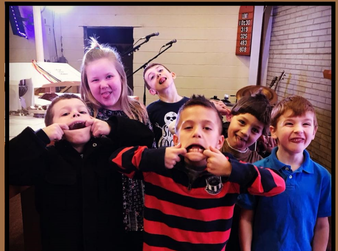
Our 2nd graders get a little silly on their scavenger hunt through church during communion instruction class.

We have a talented group of performers at Hope. Plan on spending the first weekend in March celebrating the following Hopesters on the stage!