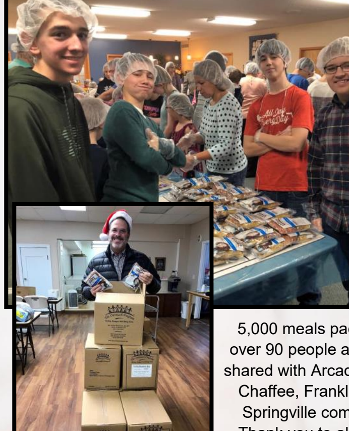
5,000 meals packaged by over 90 people at Hope and shared with Arcade, Delevan, Chaffee, Franklinville and Springville communities. Thank you to all involved!