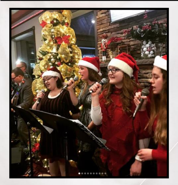
What a night! The first ever Beer & Hymns brought 100 people together to join in song, share holiday cheer and in doing so made $500 for A Future with Hope.