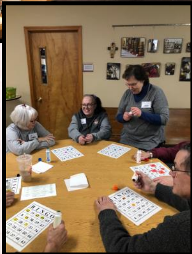
Hope Respite kicked off the first program with 5 guests and over 15 volunteers. Highlights of the day included our preschoolers singing, some competitive BINGO, sing-a-longs, parachute exercise and more! We look forward to next month!