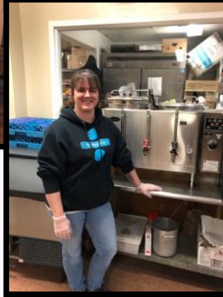
Hope spent the first part of the new year volunteering for the first time at Friends of Night People in Buffalo. This included serving meals and drinks and giving donations out at the clothing closet to those in need.