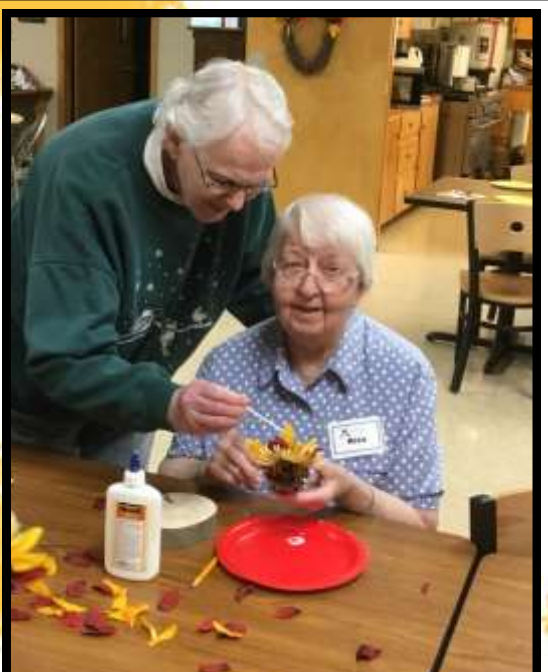
▼ Hope Respite this month revolved around all things Turkeys! Turkey crafts, games and exercise!