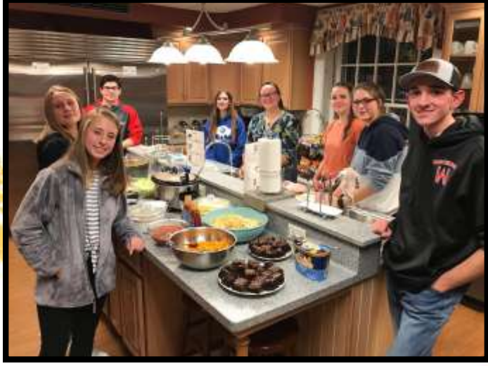
Hope youth had a fun and busy month...