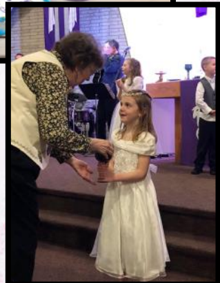
Communion Celebration 2019